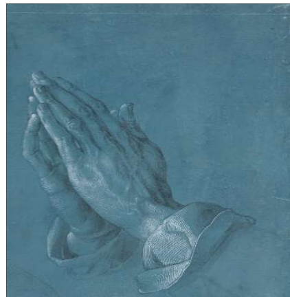
(Albrecht Dürer, 1508, Praying Hands, Albertina Museum, Vienna)

Wittenberg Door Campus Ministry is a 501(c)(3) non-profit organization. Your contributions are tax deductible to the fullest extent of the law. Checks mailed to us are deposited with no commission paid to any intermediary. Most of our contributions are actually received this way, but we can receive funds sent through Paypal or Google Pay as well. Giving is easy! Simply visit our website at www.wittenbergcomo.com and click on "about" and "support us."