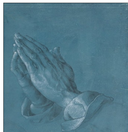
(Albrecht Dürer, 1508, Praying Hands, Albertina Museum, Vienna)

Wittenberg Door Campus Ministry is a 501(c)(3) non-profit organization. Your contributions are tax deductible to the fullest extent of the law. Checks mailed to us are deposited with no commission paid to any intermediary. Most of our contributions are actually received this way, but we can receive funds sent through Paypal or Google Pay as well. Giving is easy! Simply visit our website at www.wittenbergcomo.com and click on “about” and “support us.”