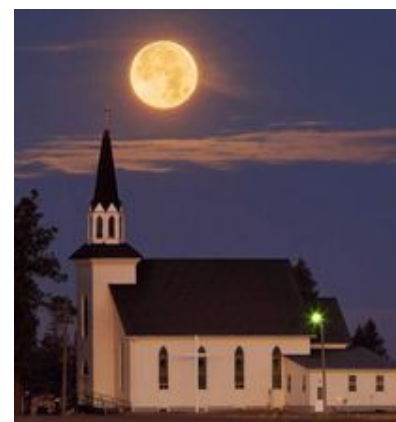
Lake Madison Lutheran Church in South Dakota is a supporter of Wittenberg Door Campus Ministry!

The question applies to all areas of the Christian faith, though. What are we actually doing when we are reading the Bible? Are we looking for a knowledge boost? Sure. What about extra insight into God's character? Our character? Our conflicts? Our fears? When we pray, we're intending to bring honor to our Lord, expressing our trust in Him. We also normally ask some things. Are we growing in our understanding that in Christ we have been given everything we need for life and godliness? When we gather with other Christians, it's probably the only place we ever sing a song in a group. Why are we doing that? Does it make a difference what we are singing? Does the sense of community have something to do with it?