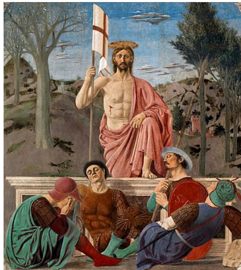
The Resurrection by Piero della Francesca Museo Civico, Sansepolcro, Italy

Our campus communities are full of people who have been told of hope, of future, and of that hope and future being something they control or will implement. They are the hope and future of our society. It hardly ever fails that, when given a promise (or a demand) like that, we will become acutely aware of our failure, our inadequacy, and the enormity of the task before us. That's one of the reasons Wittenberg Door Campus Ministry is on campus. Students, faculty, staff, and administrators who have been confronted by themselves or others with their inability to be the change they want to see in the world, come for prayer, for words of comfort, to redirect their attention to the risen Lord Jesus, who is their true hope.