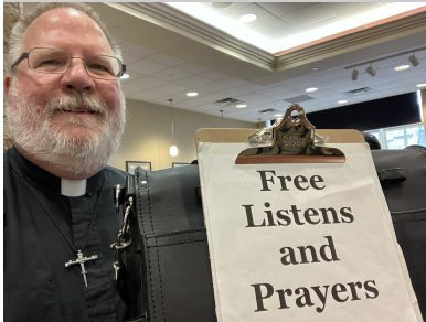
(old picture that I can display)

People continue to ask great questions! And we can bring them to our God who answers prayers – thanks be to God.