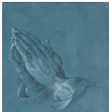
(Albrecht Dürer, 1508, Praying Hands, Albertina Museum, Vienna)

Wittenberg Door Campus Ministry is a 501(c)(3) non-profit organization. Your contributions are tax deductible to the fullest extent of the law. Checks mailed to us are deposited with no commission paid to any intermediary. Most of our contributions are actually received this way, but we can receive funds sent through Paypal or Google Pay as well. Giving is easy! Simply visit our website at www.wittenbergcomo.com and click on "about" and "support us."